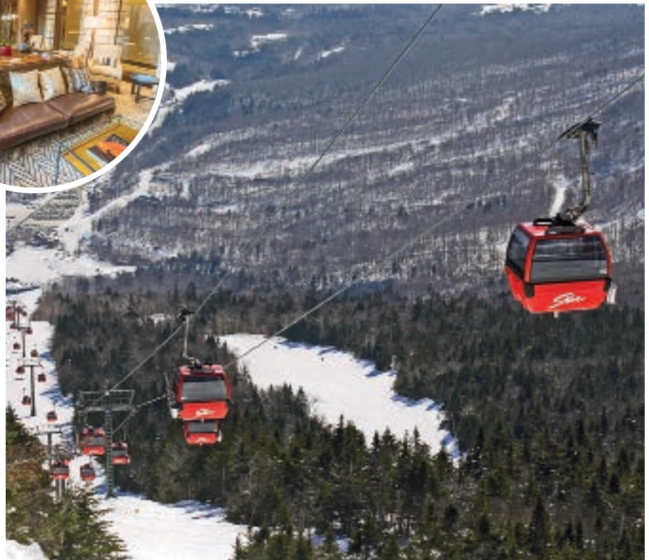
Stowe Mountain Resort