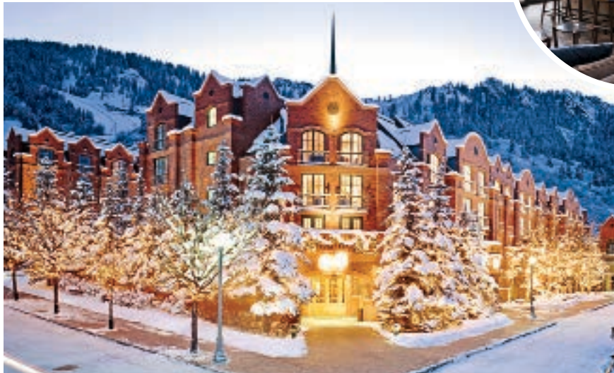
The St. Regis Aspen Resort

The St. Regis Aspen Resort (rooms from $599; 315 E. Dean St.; 970-920-3300; stregisaspen.com ) has a new altitude concierge who provides guest rooms with oxygen machines. The Viceroy Snowmass (rooms from $225; 130 Wood Rd.; 970-923-8000; viceroyhotelsandresorts.com ) has started offering ski-in/ski-out spa services, while The Little Nell (rooms from $370; 675 E. Durant Ave.; 970-920-4600; thelittlenell.com ) is now catering diners in a mining cabin at T-Lazy-7 Ranch.