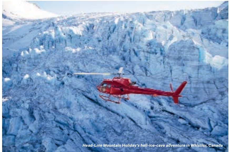
Head-Line Mountain Holiday's heli-ice-cave adventure in Whistler, Canada

The new White Carpet Club ($150 per day; beavercreek.com ), in Beaver Creek Village, has boot dryers and a concierge for lift tickets and dinner reservations. German beers are on tap at the just-debuted Bier hall at the Park Hyatt Beaver Creek (Rooms from $265; 136 E. Thomas Pl.; 970-949-1234; hyatt.com ). Remedy , the bar that recently opened at the Four Seasons Resort & Residences Vail (Rooms from $695; 1 Vail Rd.; 970-477-8600; fourseasons.com ), serves pre-Prohibition cocktails.