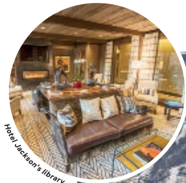
Hotel Jackson's library