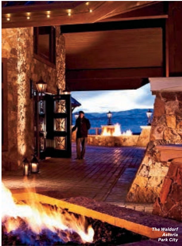
The Waldorf Astoria Park City