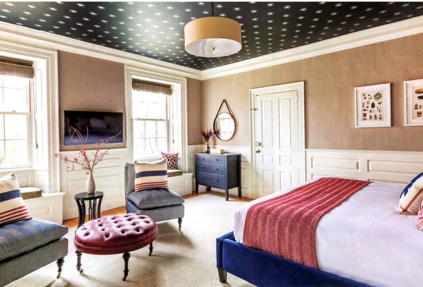
American history buffs will appreciate that President George Washington stayed at the house on Oct. 29, 1789, when he came to Salem to attend a celebration that included fireworks, speeches and a grand ball. The room where Washington slept, shown here, is known today as the “George Washington King Deluxe.”