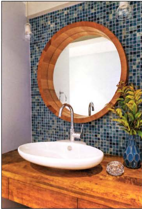
The Merchant’s Lark Suite, located beneath the eaves of the old house, has its own dedicated staircase, insuring almost complete seclusion and privacy for those who stay in it.

Guests are encouraged to help themselves to water, juice, soda, coffee, tea and light snacks from two hospitality stations, one off the lounge and the other on the third floor. A light breakfast,